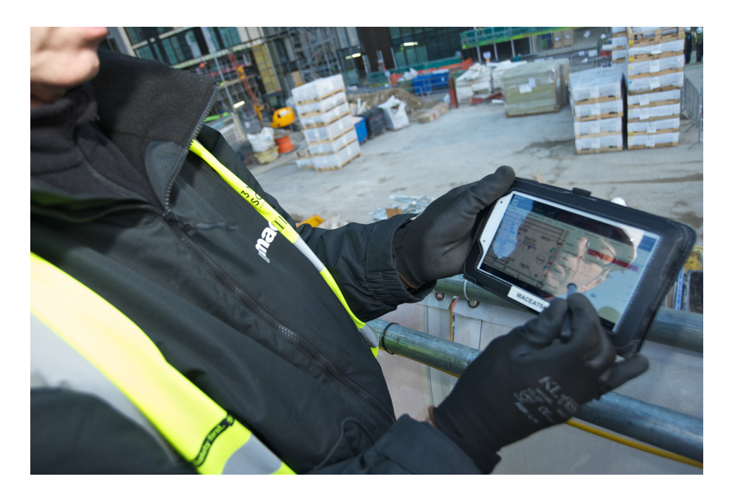
Easily capture your field observations on iOS, Android & Windows tablets