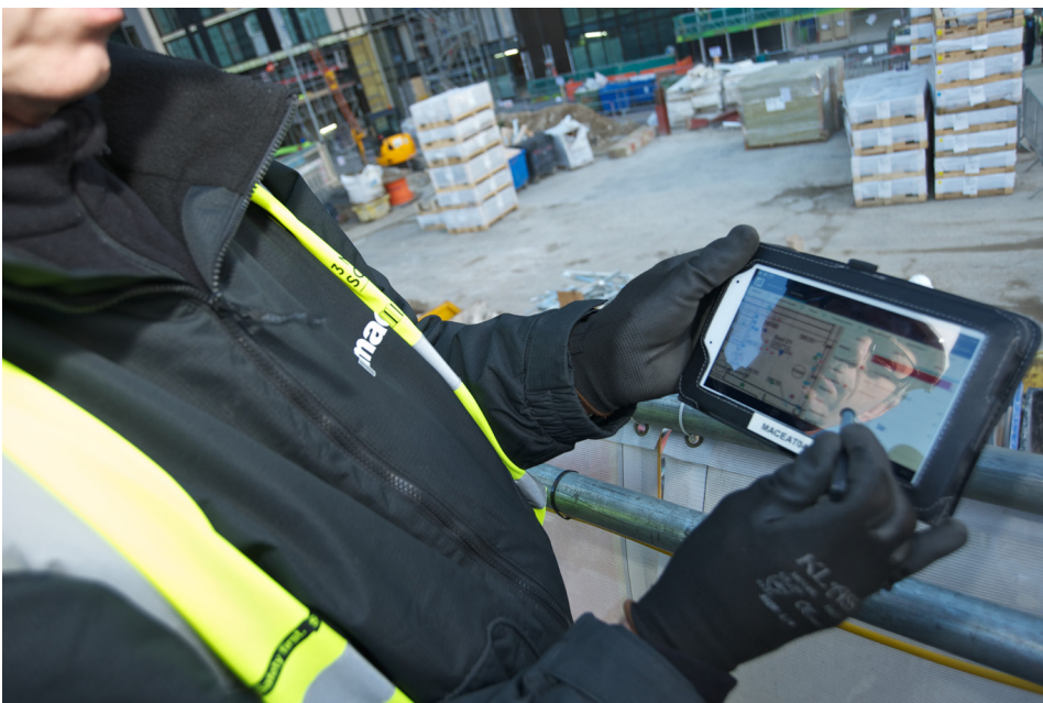
Easily capture your field observations on iOS, Android & Windows tablets